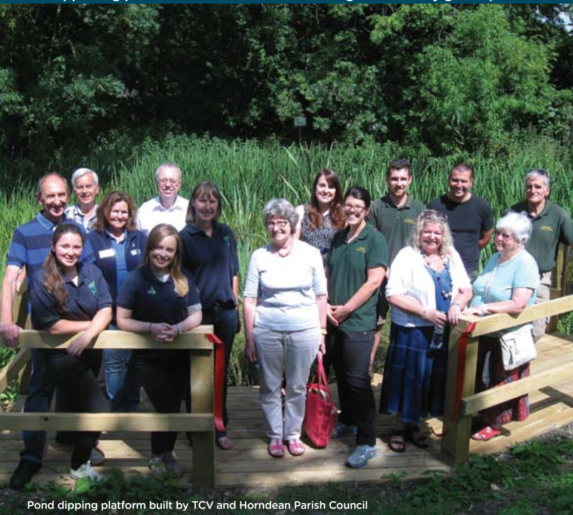
Pond dipping platform built by TCV and Horndean Parish Council

Supporting parish and town councils to manage community greenspaces