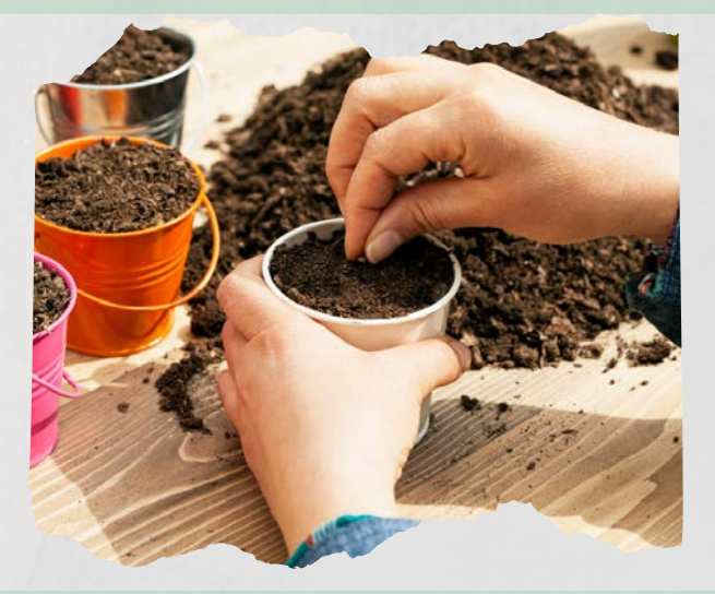
Comfrey, sweet peas, thyme and primroses are examples of plants that pollinators love in spring!